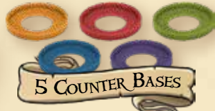
5 COUNTER BASES