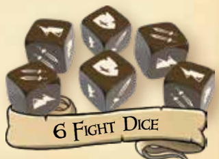
6 FIGHT DICE