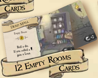
12 EMPTY ROOMS CARDS