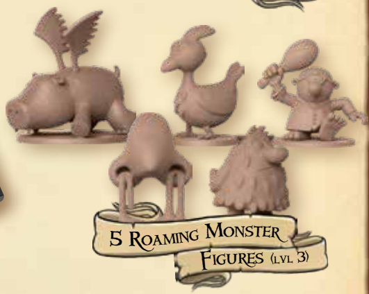
5 ROAMING MONSTER FIGURES (LVL. 3)