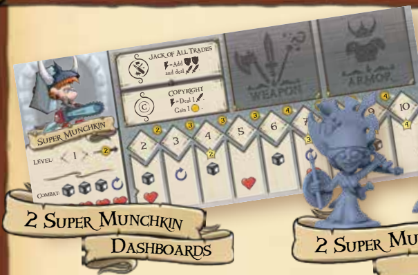
2 SUPER MUNCHKIN DASHBOARDS