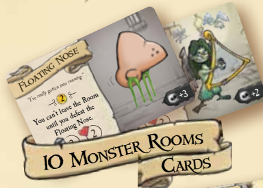
10 MONSTER ROOMS CARDS