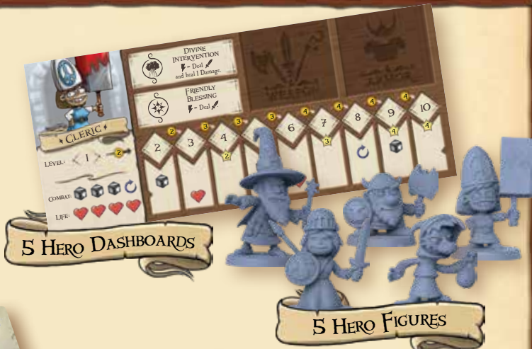
5 HERO DASHBOARDS