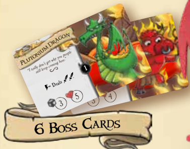
6 BOSS CARDS