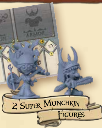
2 SUPER MUNCHKIN FIGURES