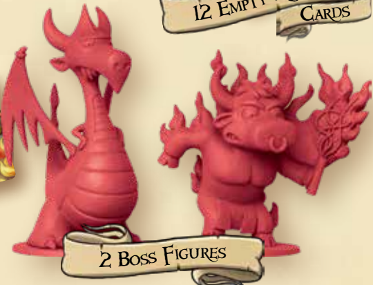
2 BOSS FIGURES