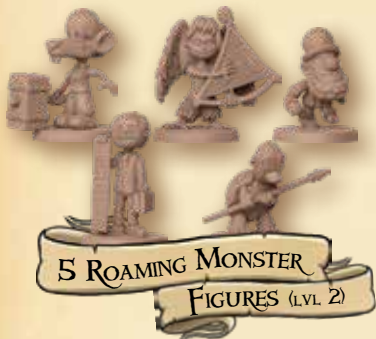
5 ROAMING MONSTER FIGURES (LVL. 2)